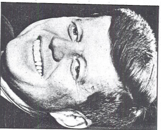
for the first time in an exclusive interview with MIDNIGHT. Another source claims that Oswald was present at the meeting.