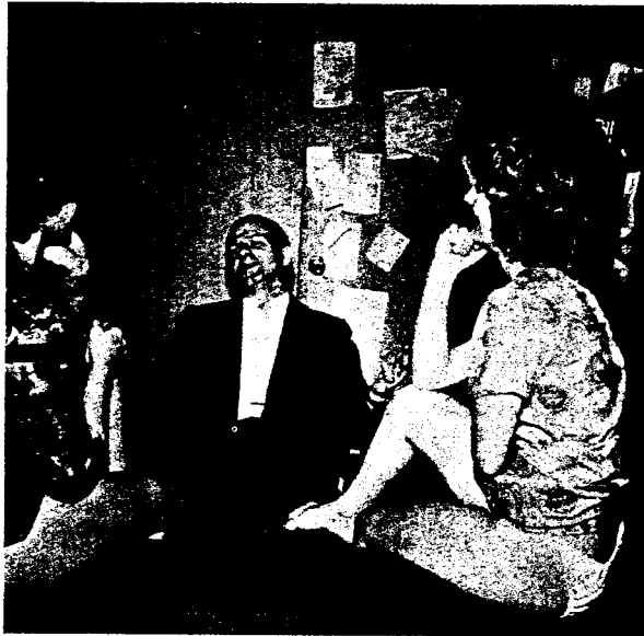
Ruby and two of his nightclub employees.