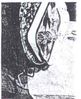
"This is the best size for barbecuing — it's meaty, sweet and juicy," he adds.

from glowing coals. Grill about 1 hour, "mopping" chicken frequently with marinade. Cook chicken skin side up most of the time. Note: Barbecue Chicken Champ Weisberg says a 2½-pound frying chicken, split in half, is what he used in the contest.