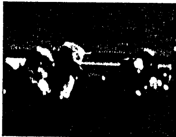
The new wave of books reexamining JFK's assassination mix old evidence and new technology. Here, "enhanced" frames from the Zapruder film.