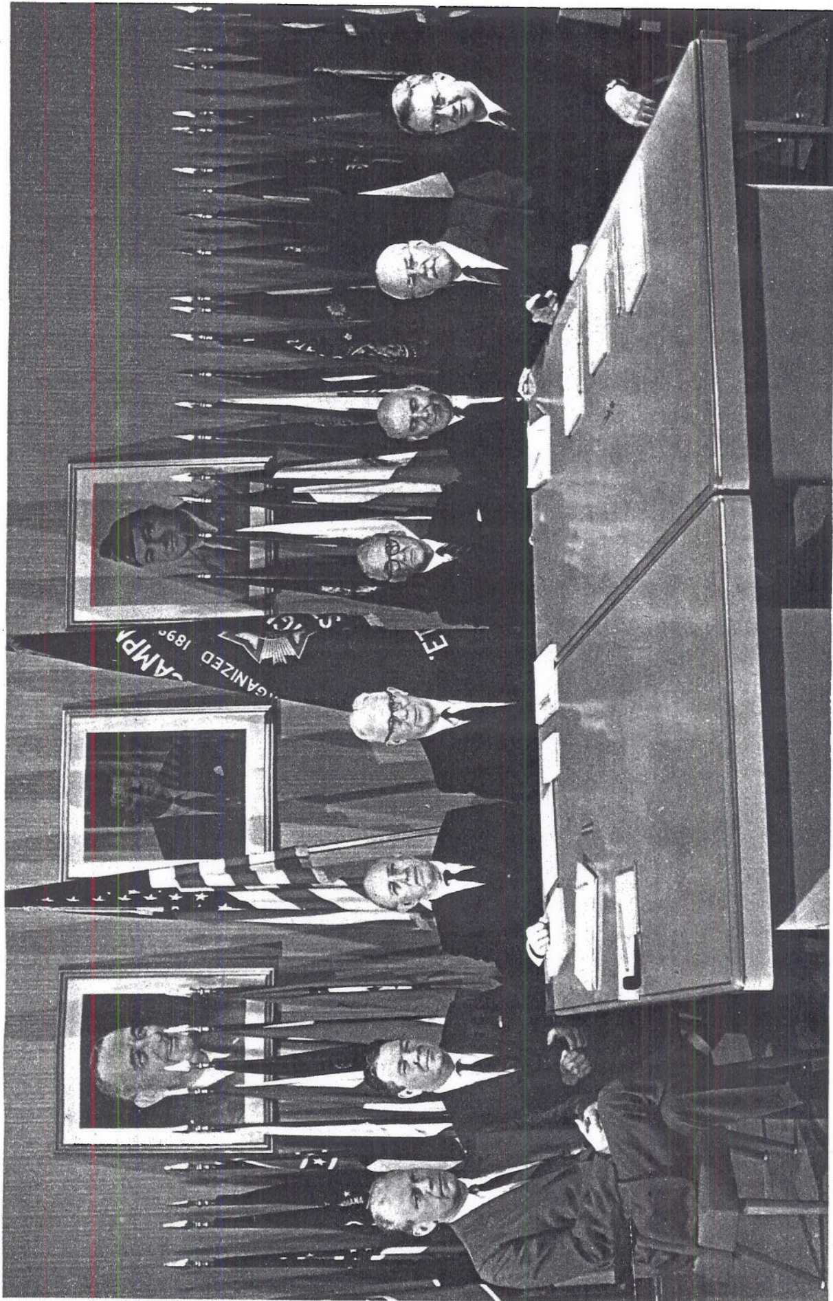
PUBLIC INQUIRY —With the prime suspect dead, President Johnson appointed the Warren Commission: From left, Representatives Gerald Ford and Hale Boggs, Senator Richard Russell, Chief Justice Earl Warren, Senator John Sherman Cooper, John McCloy, Allen Dulles and Lee Rankin, counsel.