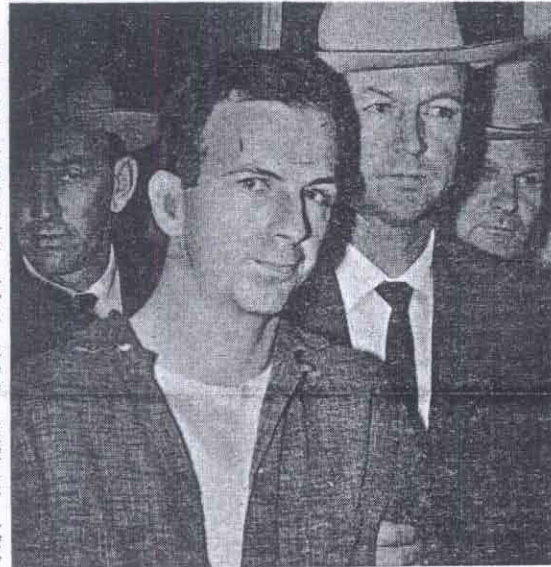
UNDER ARREST : Oswald is held by police shortly before he was shot by Jack Ruby while coming out of Dallas police station.