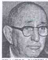
SENATOR RUSSELL Kept door open

The general stressed that Senator Richard Russell is the "one who vague-