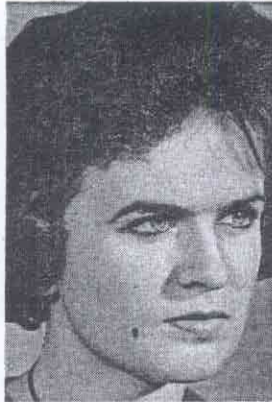
ASSASSIN'S WIFE Marina Oswald, who married Lee Harvey Oswald in Russia.

ultra-conservatism, and was relieved of his command in Germany, resigned from the U.S. Army in 1961.