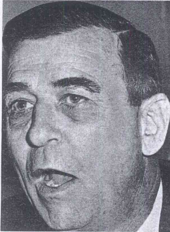
WARREN COMMISSION CRITIC: Former Major General Edwin A. Walker blasts the official Warren Report version of the JFK assassination.