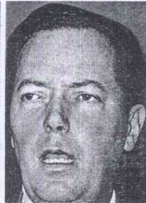
NEW ORLEANS DA Jim Garrison is praised by General Walker for digging up facts.