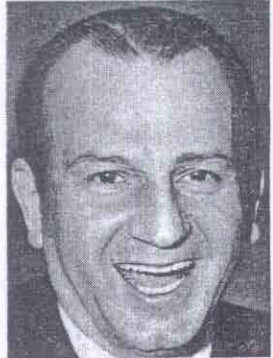
ASSASSIN'S KILLER Jack Ruby knew Oswald, says Walker.

please insert the newspaper in the files."