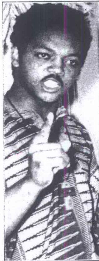
THE NATIONAL TATTLER