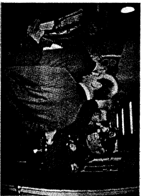
Commission Examiner No. 2423