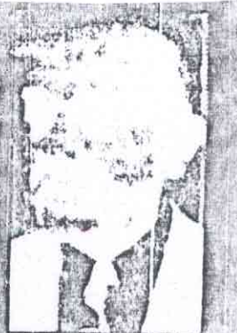
Rusk looks serious as he answers reporters' questions at Hickam.

"Naturally we try to give them space according to their status."