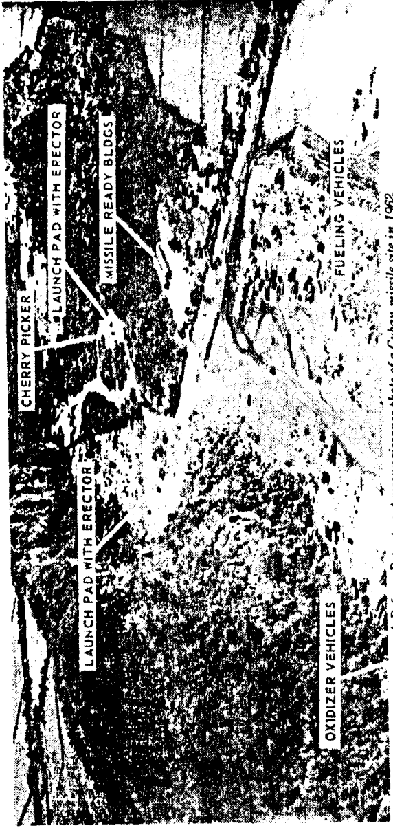
A Defense Department reconnaissance photo of a Cuban missile site in 1962.

Without going into much detail I think it is clear that both sides were scrupulous in avoiding any remote chance of an actual nuclear exchange for the simple reason that, as we all assured the president, the United States had at least a four-to-one advantage in ICBMs and perhaps an eight-to-one superiority in nuclear weapons capability if our powerful bomber air force of that era were entered into the