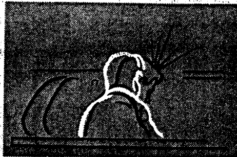
When Zapruder frames 313 (black outline) and 316 (white outline) are superimposed, it is clear that the President's head was hurled to the left and backward under the impact of the fatal shot (an impossibility if the bullet had come from Oswald's firing position).