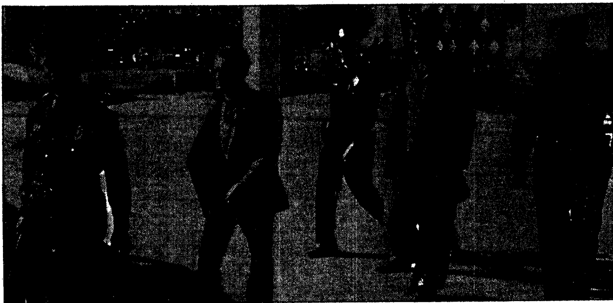
THE NATIONAL TATTLER: A Bonus Report That Cracks The Kennedy Case Page 19