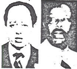
Blakey, Stokes: A case for conspiracy

At this stage we cannot comment too much on this bombshell and must await the Final Report. The 600-page Report and up to 40(!) volumes of evidence, exhibits and scientific analysis is due to be published about 30 March. We will include all details, ordering information and costs etc. just as soon as we are advised.