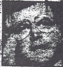
EDWARD KENNEDY Painful memories

WILSON (UPI) —Sen. Edward Kennedy won't speak at the United Auto Workers convention in Dallas because he doesn't want to visit the city where his brother was assassinated 20 years ago, the Detroit Free Press said yesterday.