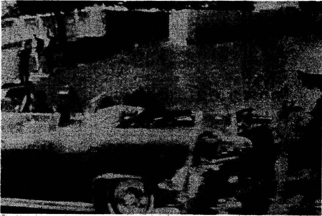
Jacqueline Kennedy Huddles Over Mortally Wounded President