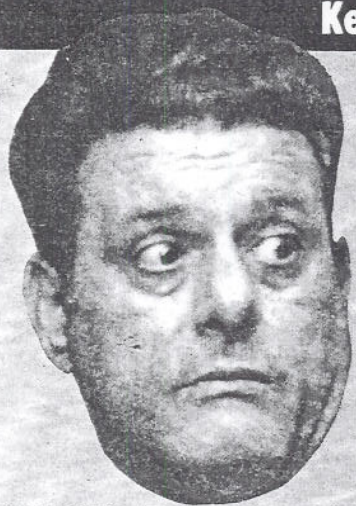
A SURPRISED Frank Sturgis after his arrest in New York.

It was a bizarre Halloween night for Frank Sturgis. The former master, spy, convicted Watergate burglar and CIA contract agent, had come to New York to confer with another top spy, Marita Lorenz, former girlfriend of Fidel Castro.