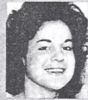
MOTHER with a secret... Marita Lorenz after her escape from Cuba.

She had told reporters that she, Sturgis, Lee Harvey Oswald and a group of anti-Castro Cubans had driven to Dallas from Miami in November, 1963, in two cars with weapons to kill the President.