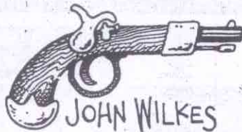
JOHN WILKES BOOTH