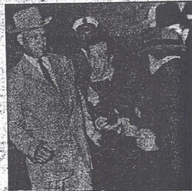
The Oswald murder as it happened in 1963.

And then, as if to quietly mock the manufactured reality of the moviemakers, two very real Dallas policemen cut their path, politely but