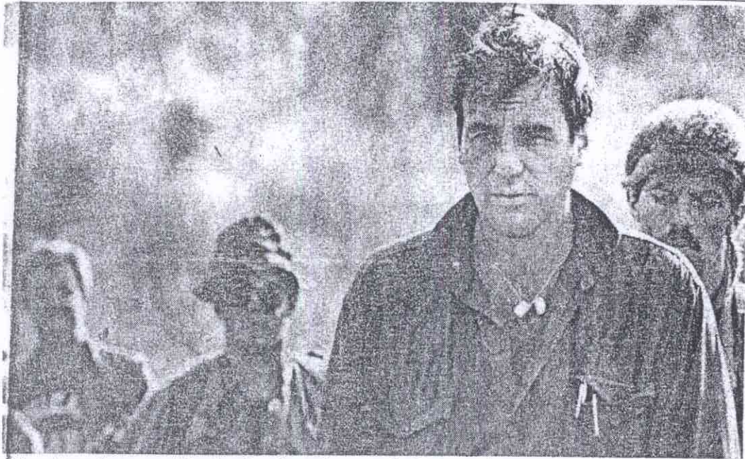
Oliver Stone (foreground) leads actors through a scene in Platoon .