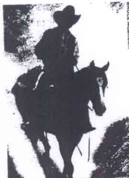
Yuppie-ki-yo: Crystal as dude