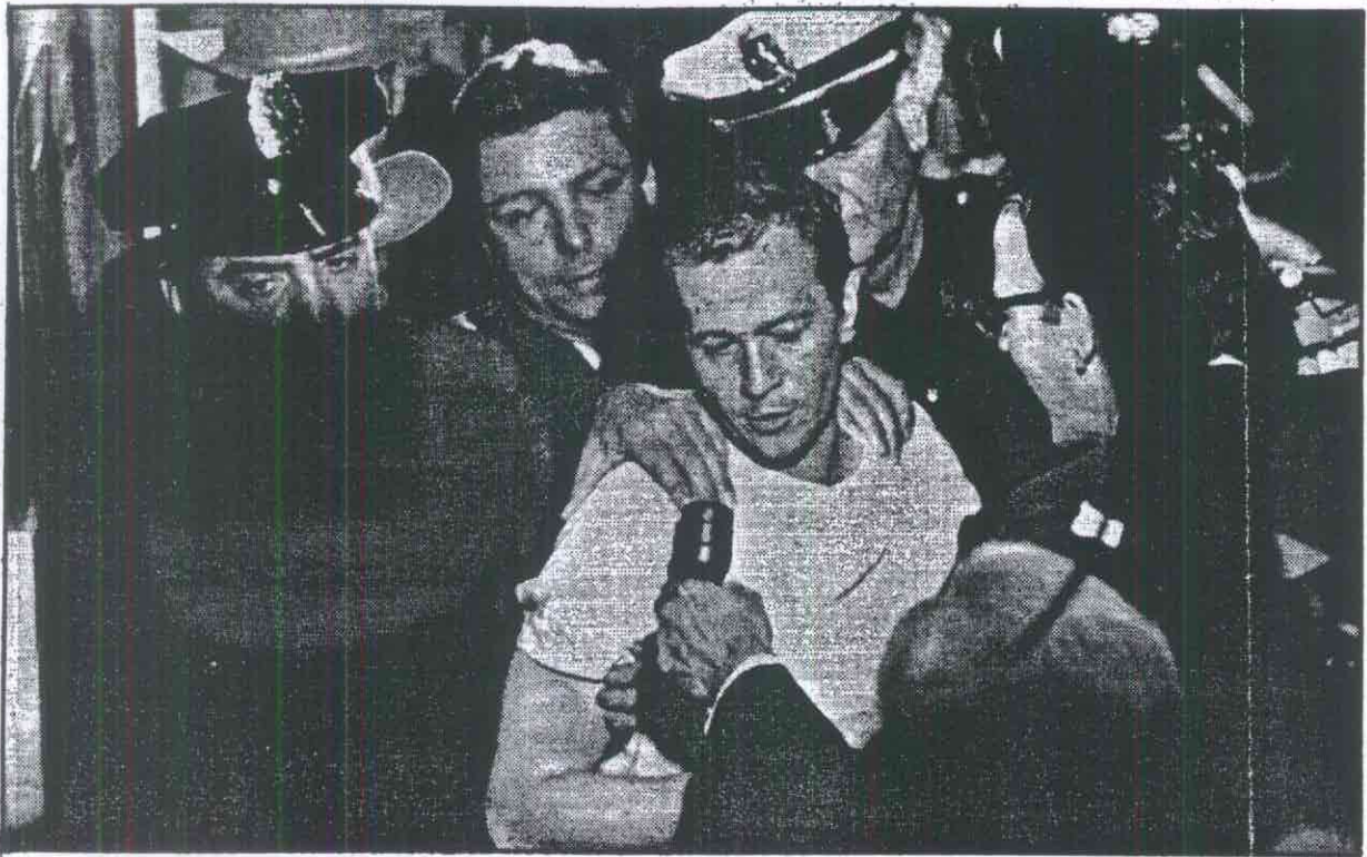
Gary Oldman is patsy Lee Harvey Oswald in 'JFK': an excellent cast of character actors