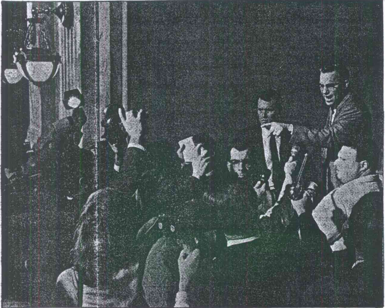
Kevin Costner as D.A. Jim Garrison confronts an angry press corps in Oliver Stone's 'JFK'

assessed Garrison serving as a sort of anchor.