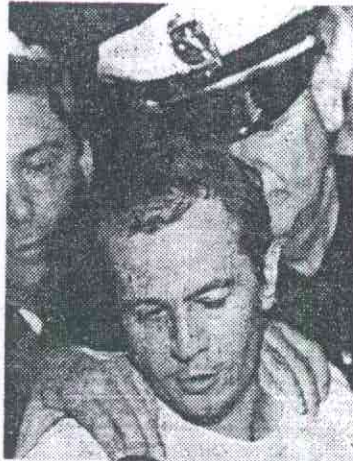
Gary Oldman as Oswald, being interviewed by reporters in "JFK."

After spending 16- and 17-hour days on the set, the indefatigable Stone sat down to pen impassioned, point-by-point rebuttals to critical stories that