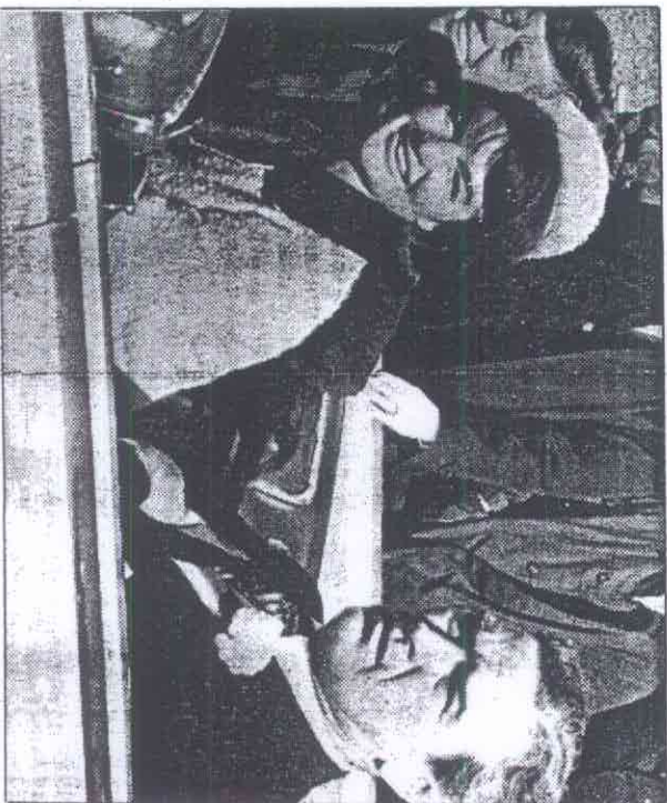
President and Mrs. Kennedy and Texas Gov. John Connally on the fateful day in 1963. A cottage industry becomes a conglomerate.