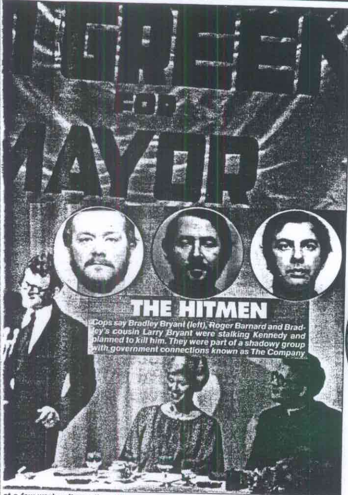
... a few weeks after police officers uncovered a sinister plot to assassinate him there

... found ... had ... flight to ... day. ... were ... phenon ... im: "Of- ... ake. I'm ... s — like ... just who ... acking a ... nm, pis- ... ringer, ... 00 bills