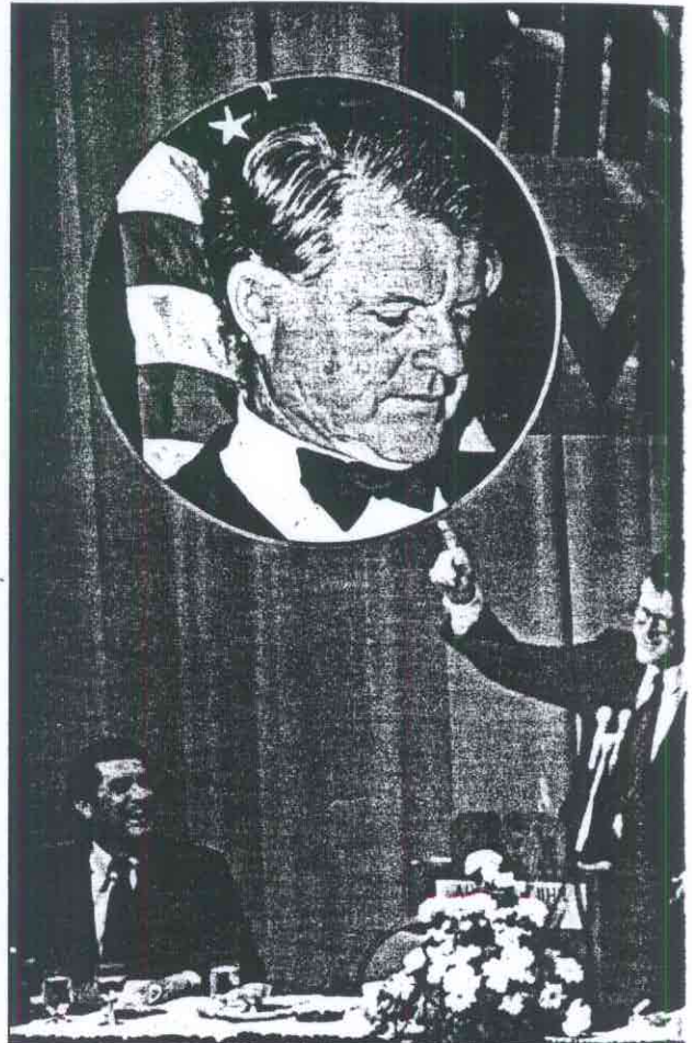
Senator Ted Kennedy campaigns for Philadelphia Mayor Bill Green just a few

Hotel staffers became suspicious when the trio paid their bills on a daily