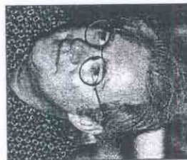
Barry Levinson "Bugsy"