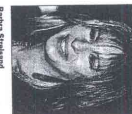
Barbra Streisand "The Prince of Tides"