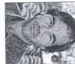
Oliver Stone "JFK"