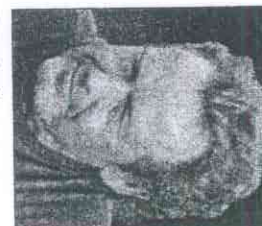
Ridley Scott "Thelma & Louise"