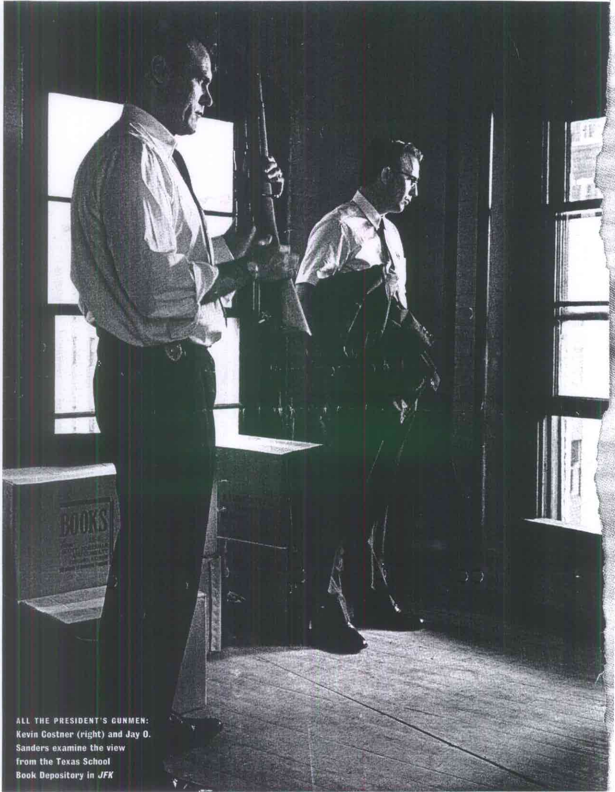
ALL THE PRESIDENT'S GUNMEN: Kevin Costner (right) and Jay O. Sanders examine the view from the Texas School Book Depository in JFK