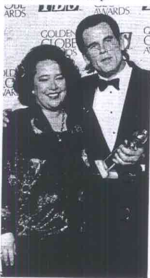
Left, presenter Kathy Bates with best drama actor winner Nick Nolte. Right, best drama actress Jodie Foster.

CBS took all series categories, except best supporting actress in a series, miniseries or telefilm, which went to Brit Amanda Donohoe for her "L.A. Law" role on NBC, and for best actor in a drama series, snagged by Scott Bakula of NBC's "Quantum Leap."