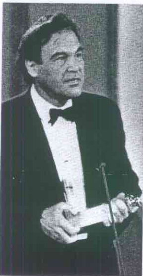
Best film director Oliver Stone accepts for his work on "JFK."

Backstage, Midler roamed from rage to resignation and termed the