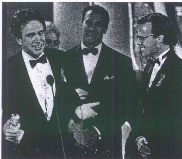
Going "Bugsy": From left, Warren Beatty, director Barry Levinson, presenter Arnold Schwarzenegger and producer Mark Johnson.