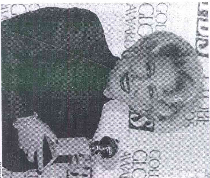
Bette Midler won best actress for "For the Boys."