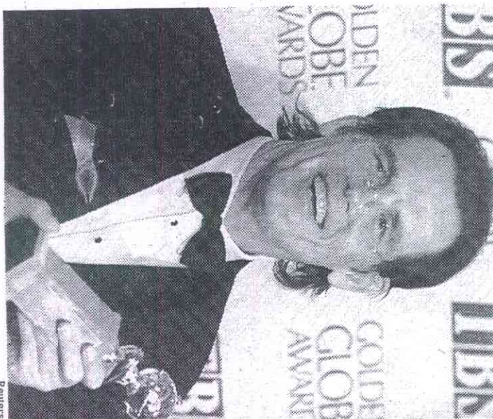
Nick Nolte won best actor for "Prince of Tides."

The major winners this year included "Bugsy," as best picture of the year, as well as "Beauty and the Beast," as best musical (as well as two other awards) and "Europa, Europa" as best foreign film (though a German selection committee of film makers has declined to nominate it for an Oscar; the film deals with Nazi Germany during World War II). Acting awards went to Jodie Foster, for "Silence of the Lambs," Nick Nolte, for "Prince of Tides," Mercedes Ruehl and Robin Williams for "The Fisher King," Bette Midler for "For the Boys" and Jack Palance for "City Slickers." Callie Khouri won for the screenplay of "Thelma and Louise," and Oliver Stone got a prize for his direction of "J. F. K."