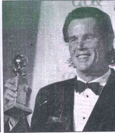
Performances by Jodie Foster and Nick Nolte win best-acting honors at the Golden Globe awards ceremonies on Saturday.

Beast" were being interviewed as Nick Nolte (best actor in "The Prince of Tides") and Jodie Foster (best actress in "The Silence of the Lambs") stood by. Press questions for them eventually caused a backup of the other potential competitors, the winners for "Bugsy" and "JFK."