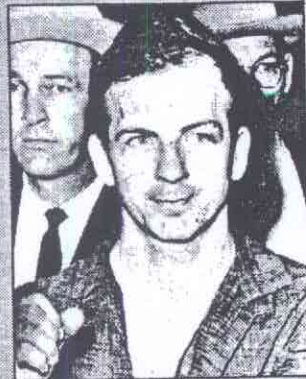
OSWALD: Officially the lone killer of President Kennedy

► PBS will rerun the 1988 documentary Who Shot President Kennedy Feb. 25.