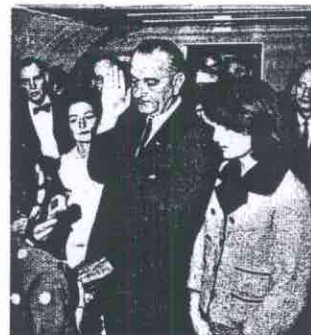
Lyndon Baines Johnson, with Jacqueline Kennedy, being sworn in as the 36th president of the United States. Under his administration, the U.S. escalated the Vietnam War.