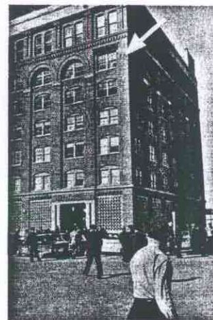
Did the shots come only from this building? The Warren Commission says yes, but many—including the House Select Committee on Assassinations, Garrison, and Stone—say no.

Kennedy knew that with a 1964 re-election victory, he could move forcefully to end the Cold War.