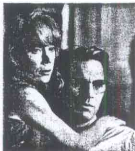
Spacek and Costner: Stone charges that Garrison has been portrayed by a hostile press as a kook, a new Huey Long.

placed Ruby in Dealey Plaza that day and at Parkland Hospital.