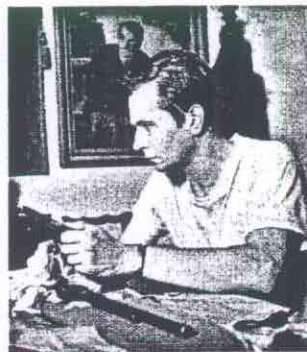
Center: Mug shot of the real Lee Harvey Oswald. Above: Gary Oldman as Oswald

his lines ver- batim from tran- scripts and news footage.