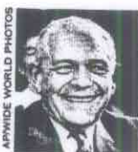
Clay Shaw was tried by Garrison for conspiring to kill President Kennedy.

Garrison let in the light on a taboo subject that some very powerful people wanted to remain hidden.