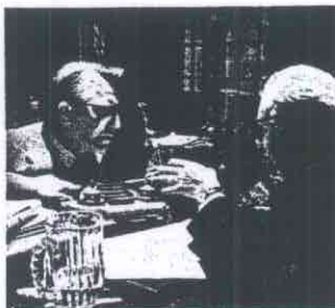
Top: The real Jim Garrison in 1967. Above: Kevin Costner playing the New Orleans D.A.; Stone made Garrison's Capraesque story the spine of his movie.