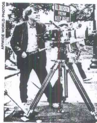
Stone setting up the fatal motorcade