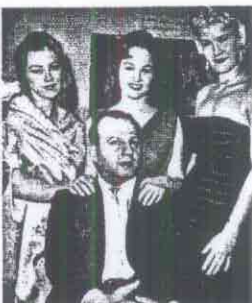
Above: The real Jack Ruby and his "girls." Below: The real Ruby shooting the real Oswald