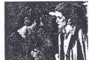
Eric Bogosian and Leslie Hope appeared in "Talk Radio," a film about a hate crime.

Along with his directorial credits, Stone has penned the screenplays for "Scarface," "Midnight Express," "Conan the Barbarian" and "Year of the Dragon," and has recently launched an additional career as co-producer, with "Reversal of Fortune" topping his resume in that capacity.