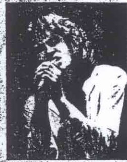
Val Kilmer starred as Jim Morrison in "The Doors"; he's to back for an encore in "JFK."

Stone directed his first picture in 1981 — the horror thriller "The Hand," starring Michael Caine — but didn't come to prominence until five years later when "Platoon," an anti-war tale set in Vietnam (where Stone fought from 1967-68), won the Academy Award for Best Picture and Best Director. Stone's film served notice to a wide audience that a radical reassessment of the