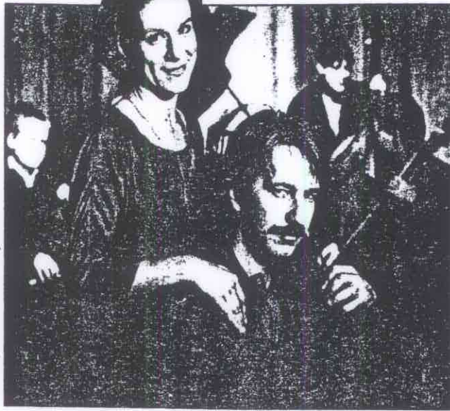
Juliet Stevenson and Alan Rickman star as lover and ghost in 'Truly, Madly, Deeply.'

To do that, of course, she'll need to date a live man (conveniently, there's a nice one waiting in the wings). And to do that