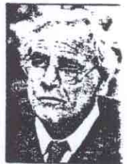
Marlon Brando in 'A Dry White Season'