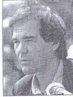
JACK VALENTI Motion Picture Assn. president

'[Valenti is] a former government official who never did anything to get the files released.'