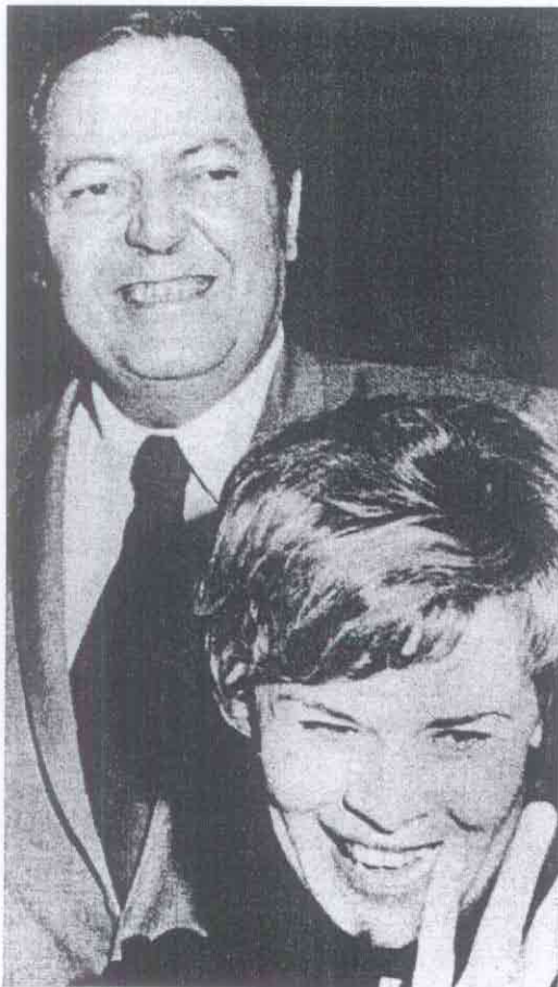
New Orleans Times-Picayune file photo

A: The perspective from the seventh floor is not that different from the sixth floor, except that the ledge hangs out further than the ledge on the sixth floor. And the relationship to the tree is different. The shape of the window is different.