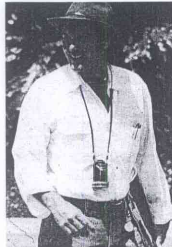
Director Oliver Stone will be in town through July filming 'JFK,' a movie he calls 'a tale of two cities.'

Slinging a tote bag over his shoulder, a casually dressed Oliver Stone saunters through a hotel lobby en route to the lounge. Easing his rangy frame onto a banquette, the 44-year-old director orders drinks and swaps introductory small talk with the reporter who's come to discuss "JFK," the film Stone will start shooting two days later. His now-familiar face — earnest, open, unassertively handsome — betrays fatigue, but Stone is otherwise in buoyant spirits. He gazes appreciatively at a sweeping view of the Mississippi River many stories below, and recalls his first visit to the Big Easy.