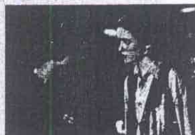
Eric Bogosian and Leslie Hope appeared in 'Talk Radio,' a film about a hate crime.

Along with his directorial credits, Stone has penned the screenplays for "Scarface," "Midnight Express," "Conan the Barbarian" and "Year of the Dragon," and has recently launched an additional career as co-producer, with "Reversal of Fortune" topping his resume in that capacity.