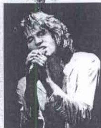
Val Kilmer starred as Jim Morrison in 'The Doors'; he's back for an encore in 'JFK.'

Though Oliver Stone is justifiably known as America's foremost cinematic chronicler of the 1960s, his issue-oriented films have touched on a wide variety of controversial subjects from both the '60s and the '90s.