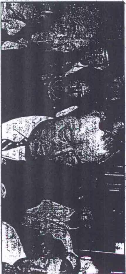
Jim Garrison at a press conference in 1967 during his probe of the Kennedy assassination.

In fact, he says, to judge any film from the reading of a script, even the draft actually used, is a mistake — camera angles, lighting, framing and editing can influence the tone and even the content of a film as much as words. One possibility is that the finished film will be color-coded, with different stock for flashbacks, for instance. "A lot will depend on the editing, what stays, what goes," Stone says. "I'm trying for a three-hour film. It should be a 12-hour film." Either way, Stone says, "You have to composite time, characters and events. Shakespeare took liberties with 'Richard III.' Orson Welles did, too, with 'William Randolph Hearst in 'Citizen Kane.' I feel I've behaved responsibly. I've done all my homework. I have tried to in-