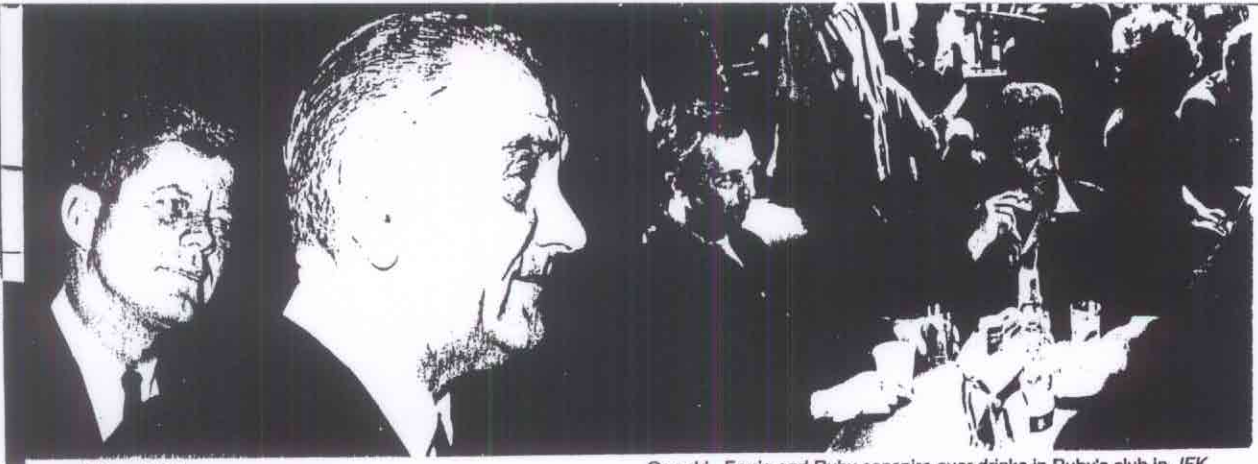
JFK and LBJ