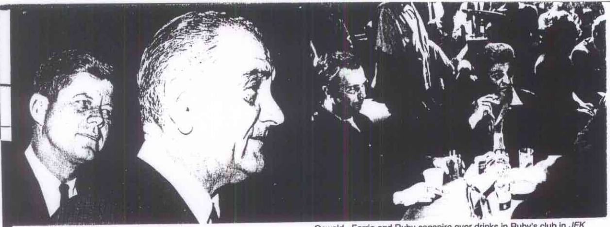
JFK and LBJ