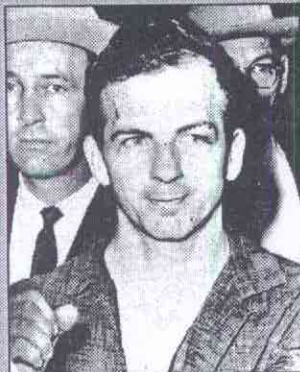
OSWALD: Officially the lone killer of President Kennedy

▶ PBS will rerun the 1988 documentary Who Shot President Kennedy Feb. 25.