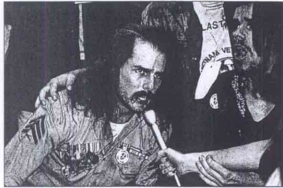
Oliver Stone directed Tom Cruise as Ron Kovic in "Born on the Fourth of July," above; financial sharks Charlie Sheen and Michael Douglas in "Wall Street," below, and Tom Berenger in "Platoon," bottom, which depicted Stone's tour of duty in Vietnam. He earned best-direction Oscars for "July" and "Platoon."