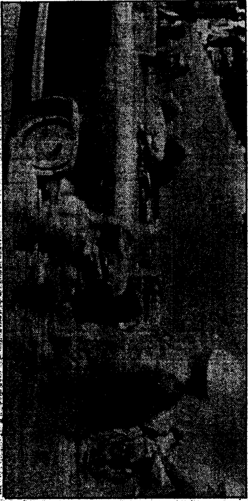
The death of JFK. A computer found out where the bullet came from and who fired them.