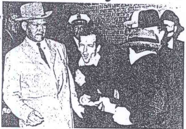
Lee Harvey Oswald (center) is conveniently murdered by Jack Ruby (right, back to camera), making it impossible for Oswald to testify in court.