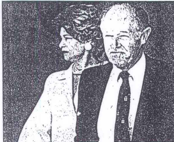
Watergate burglar E. Howard Hunt and his wife Laura are pictured in Miami during the trial that pitted Hunt against this newspaper and its publisher.