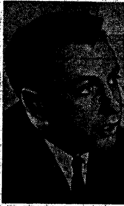
ARLEN SPECTER ... not on defensive