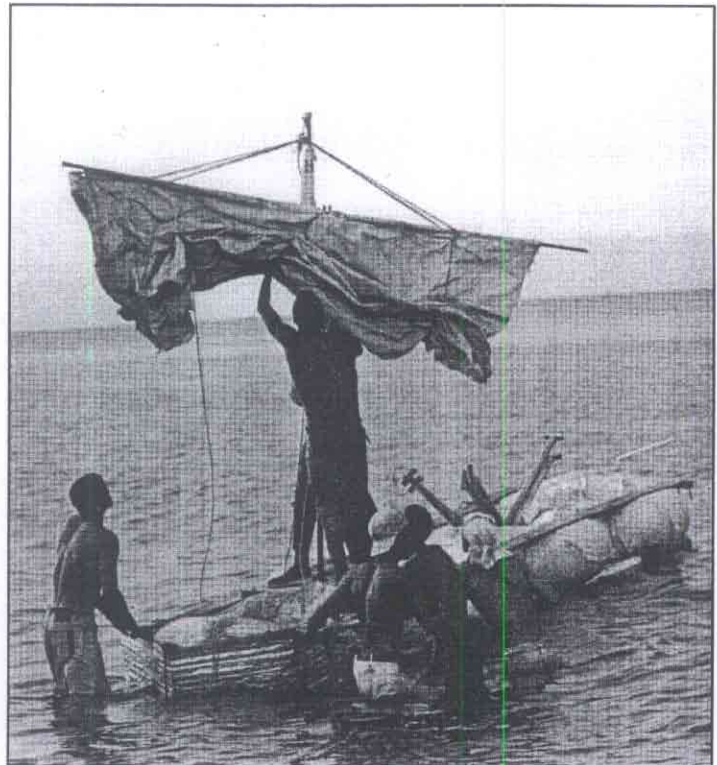
Cuban rafters set sail for Florida in 1994.

problems with many of our most important allies and trading partners and has placed at some risk the viability of the World Trade Organization, a body which has served U.S. interests well. Thus, while with the end of