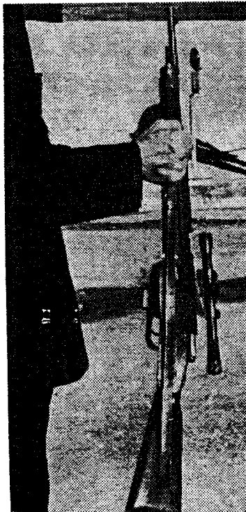
The rifle that killed JFK.

The car in which I rode as a press association reporter was not far from the presidential vehicle and in clear view of it. We were at the point of