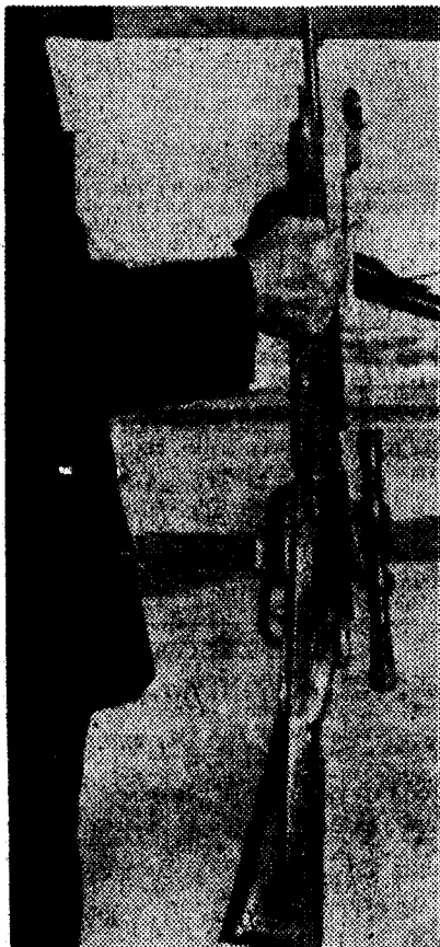
The rifle that killed JFK.

"... the President was shot from both front and back. Nothing else makes sense. Nothing else is possible,