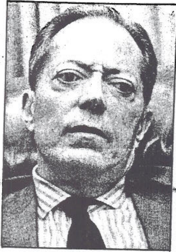
Jim Garrison In Tulane University Hospital