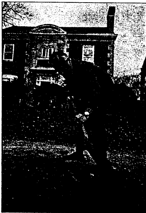
"KILLER" SCHORR AT A BRIEFING (ABOVE) AND AT HOME (RIGHT); (LEFT) FORMER CIA DIRECTORS HELMS (TOP) AND COLBY (BOTTOM)