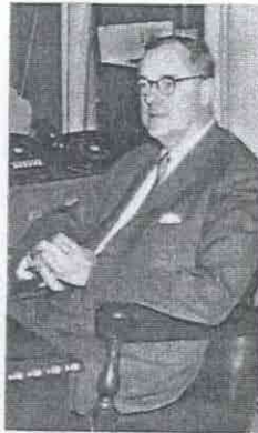
Richard M. Bissell Jr. of the CIA, an originator of the invasion plan, argued persuasively that the exiles' attack would result in popular Cuban uprising.

to make the main arguments for action. Bissell had congressed and fought through the plan of U-2 flights over the Soviet Union, and though this led to trouble in 1960, it still remained perhaps the greatest intelligence coup since the war. He had committed himself to the Cuban project with equal intensity. Both Dulles and Bissell were at a disadvantage in having to persuade a skeptical new administra-