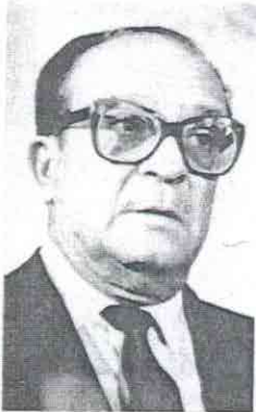
Cuban leader Miró Cardona said he had been promised 10,000 U.S. troops—a mistake, says Schlesinger, caused by his faulty understanding of English.

My memoranda look nice on the record, but they represented, of course the easy way out. In the months after the Bay of Pigs I bitterly reproached myself for having kept so silent during those meetings in the Cabinet room. I can only explain my failure to do more than raise a few timid questions by reporting that one's impulse to blow the whistle on this nonsense was simply undone by the circumstances of the occasion. It is one thing for a special assistant, like myself, to talk frankly in private