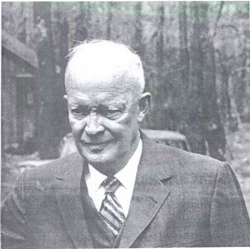
Kennedy, showing the impact of the failure, met with former President Eisenhower five days after the invasion.