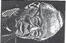
Arthur M. Schlesinger Jr. was part of debate preparations at Centre College.

"But it will be a very close election," he said. The greatest American presidents were Abraham Lincoln, George Washington and Franklin Delano Roosevelt, Schlesinger said. "I see no resemblance of them with Gore or Bush."