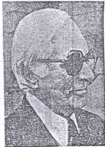
John Roselli