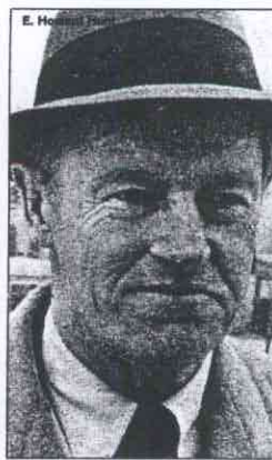
E. Howard Hunt